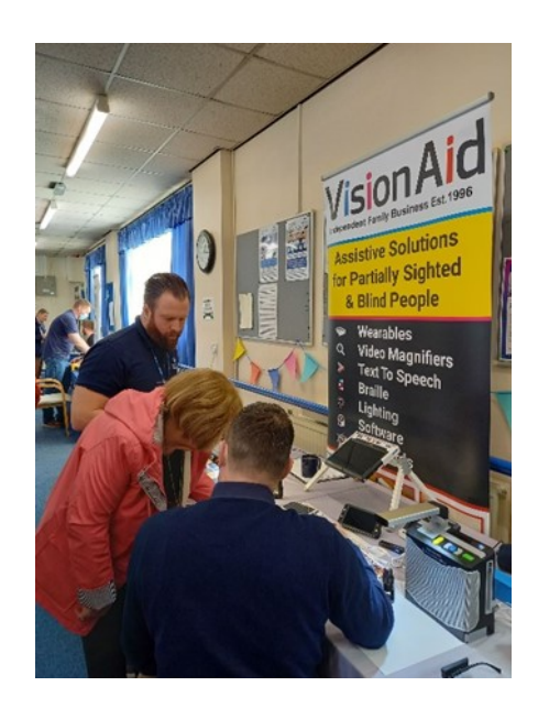
Friday 17th March 2023 Sight Support Main Hall 10am - 3pm

Our annual Low Vision Exhibition will feature exhibitors from around the country who will be on hand to showcase equipment and services, specifically designed for people with visual impairment including optical and video magnifiers, CCTV machines, assistive software, accessible mobile phones and independent living aids. There will also be representatives from other local and national organisations who offer support to people with visual