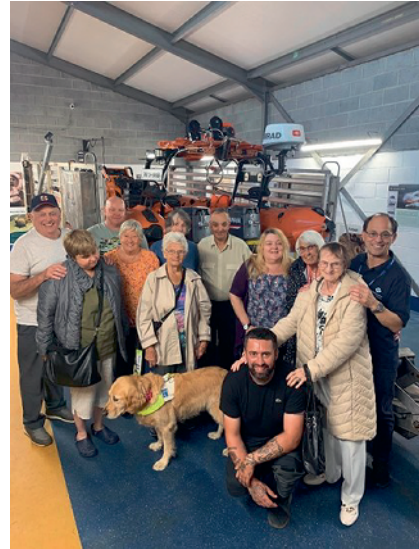
(A visit to Hornsea Inshore Lifeboat pictured above)