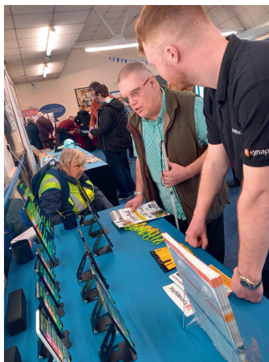
Low Vision Exhibition 2023 pictured above.